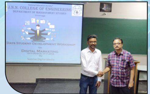
Student Development Workshop