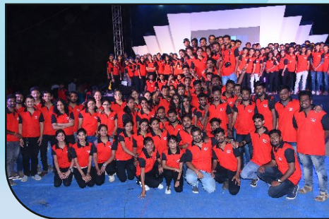
Utthana - UG Fest